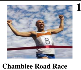
Chamblee Road Race